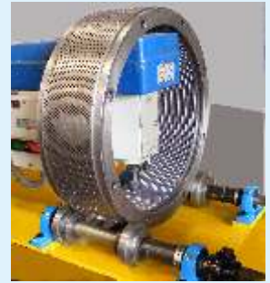
Automated Counter sinking