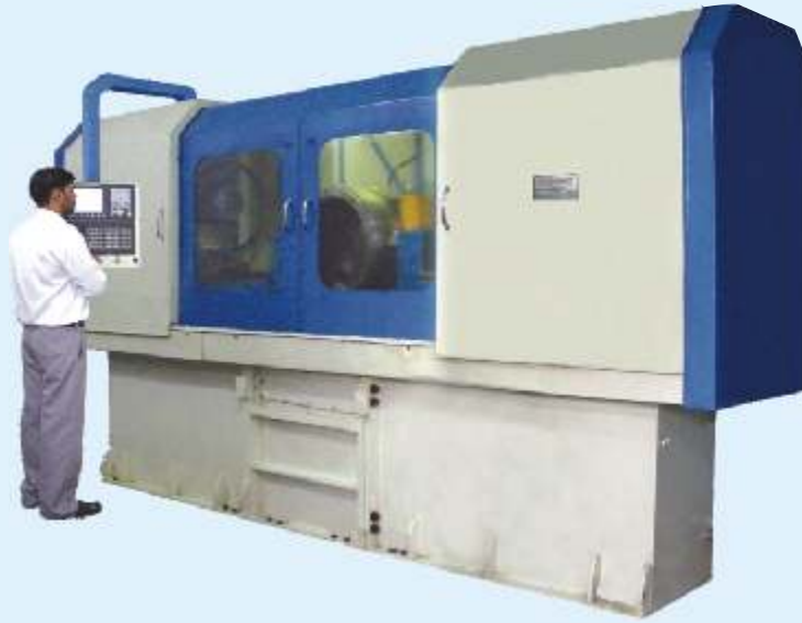
In house German CNC Gun Drilling facility